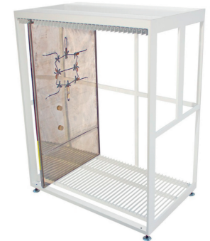
Shapes Storage Rack