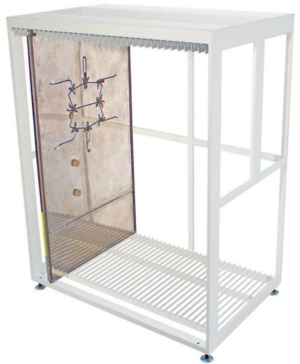
Shapes Storage Rack